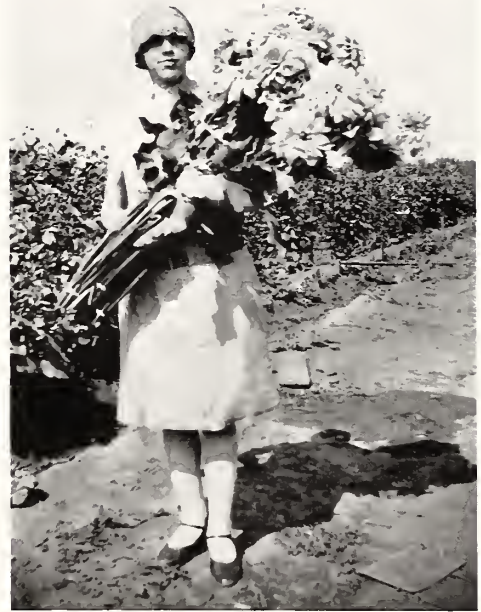
These Dahlias cut from our one year 1928 Seedlings. Note length of stems.

Why not be the originator of a nationally known variety yourself? The pleasures of growing dahlias from seed are untold. The varieties and color combinations of Dahlias produced from seed are numberless. The plants will bloom the first season making as large a plant, and producing as many flowers, as those planted from tubers. There are always new types and new colors and you may originate some-